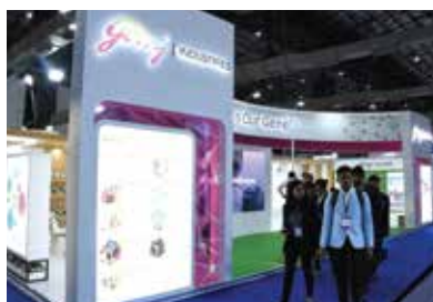
GODREJ INDUSTRIES LTD.