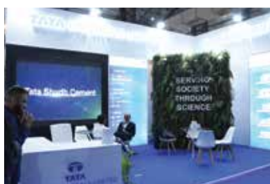
TATA CHEMICALS LTD.